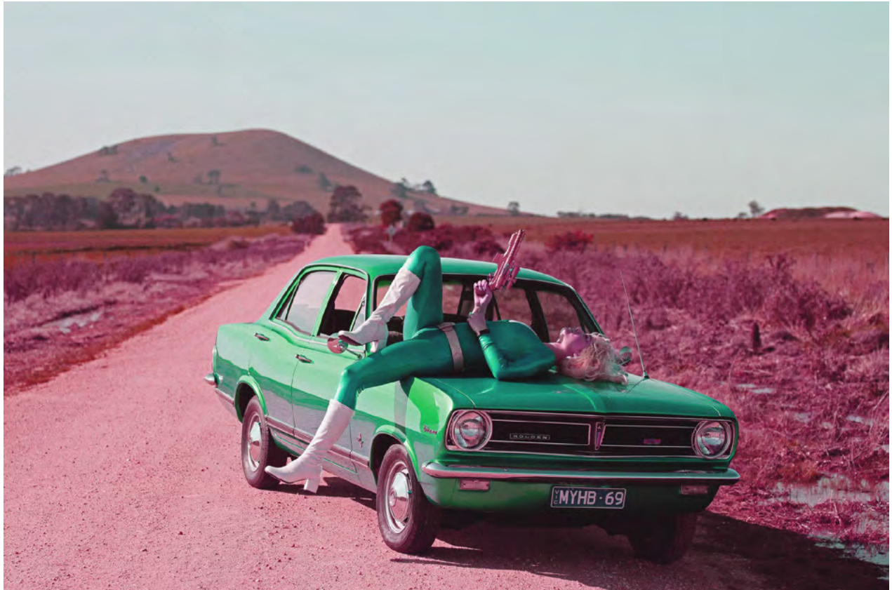
Interplanetary funk By Em Jensen Framed archival print 47x37cm $220 SOLD