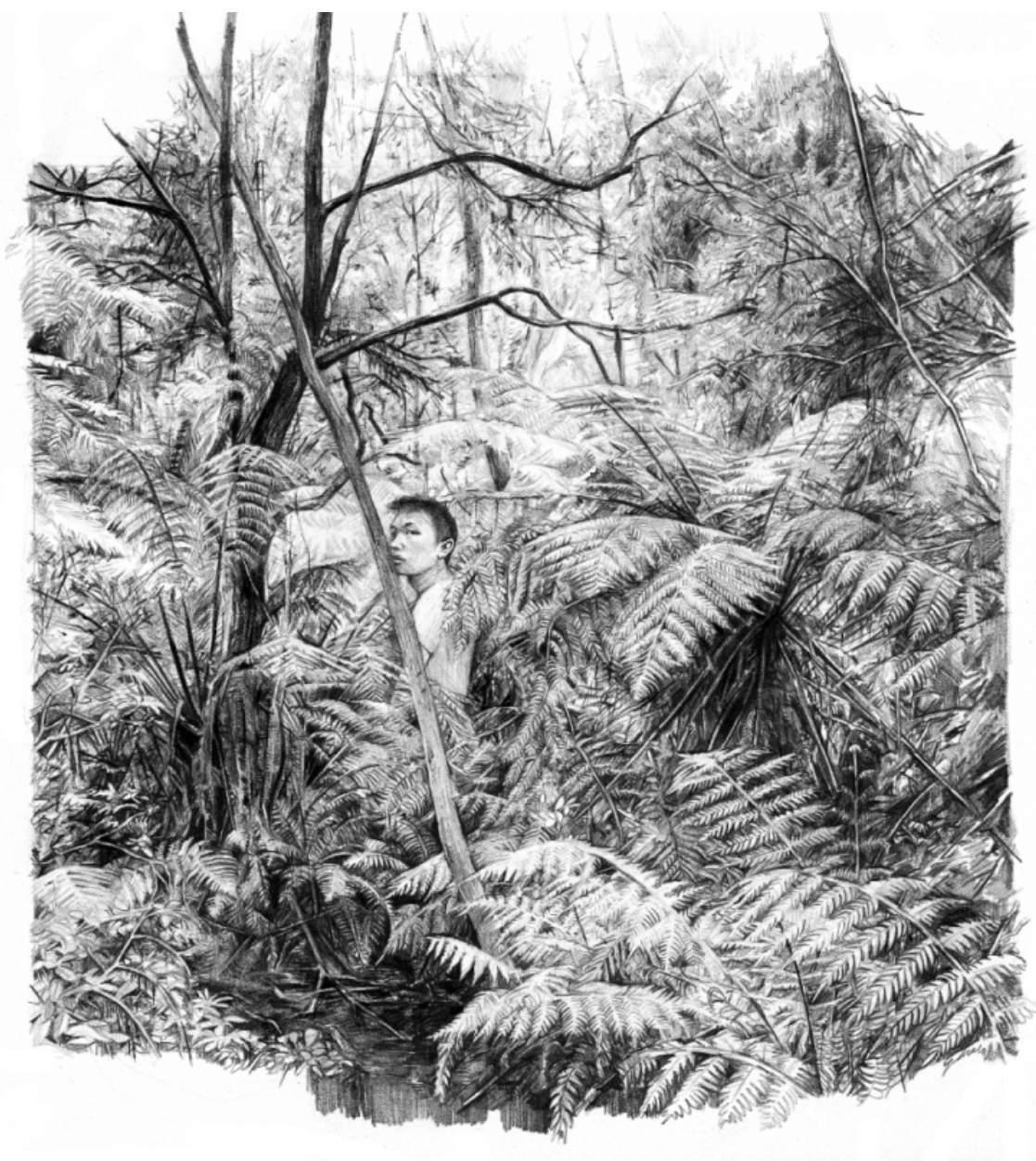
Elsewhere By Brian Cheung Graphite on paper framed 30cm x 31cm $620