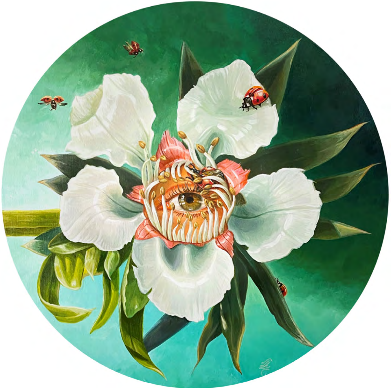
Lady By David Lee Pereira Acrylic and Resin on wood panel 30cm diameter $1,850 SOLD

OPENING FRI 9 APR 6-9PM DATES 8 - 22 APR 2021