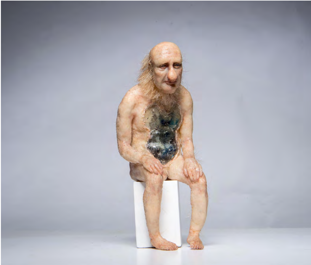
In Essence By Lauri Smith Silicone, Resin, Acrylic Paint, Hair 34cm x 15cm x 18cm $5,850