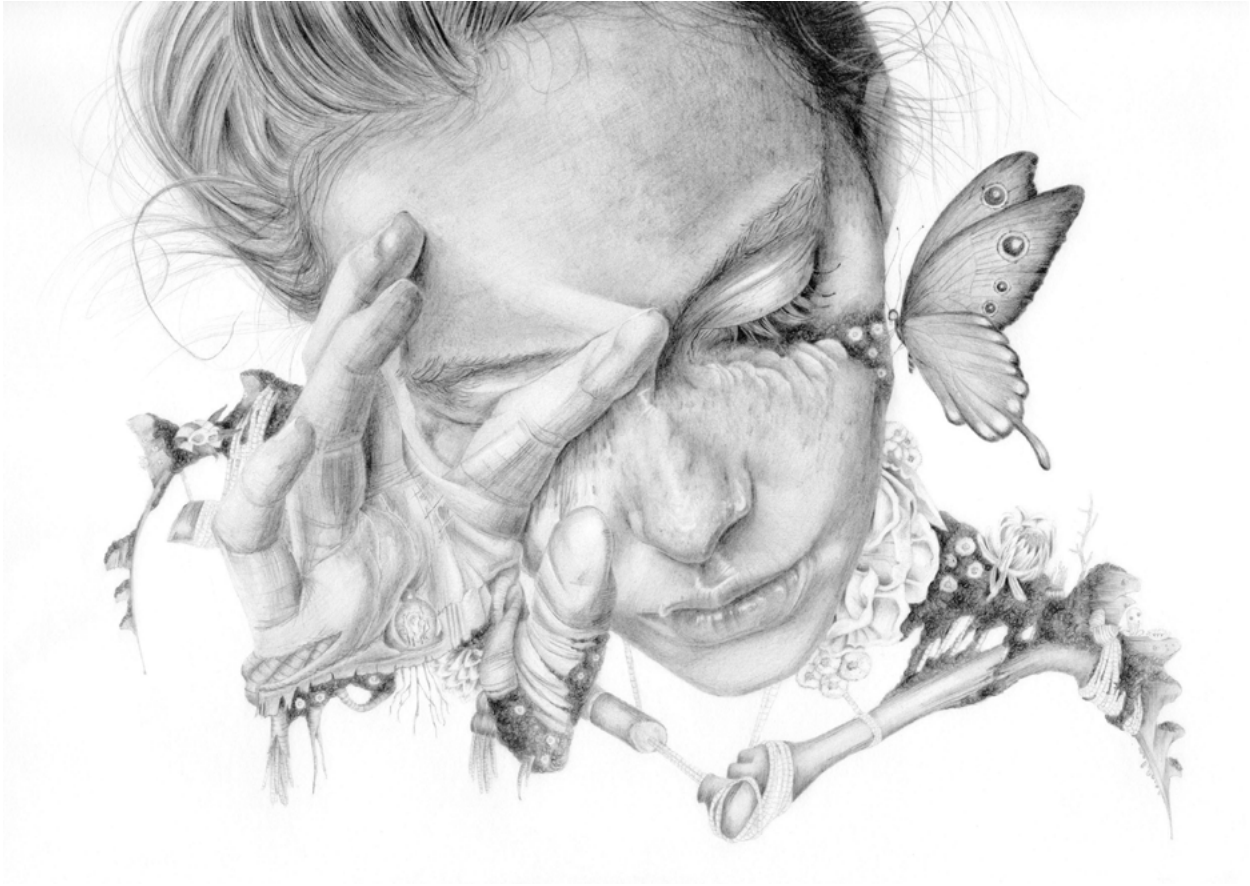
De rouille et d'os (Rust and Bone) Graphite on paper framed 44x53cm $420 SOLD