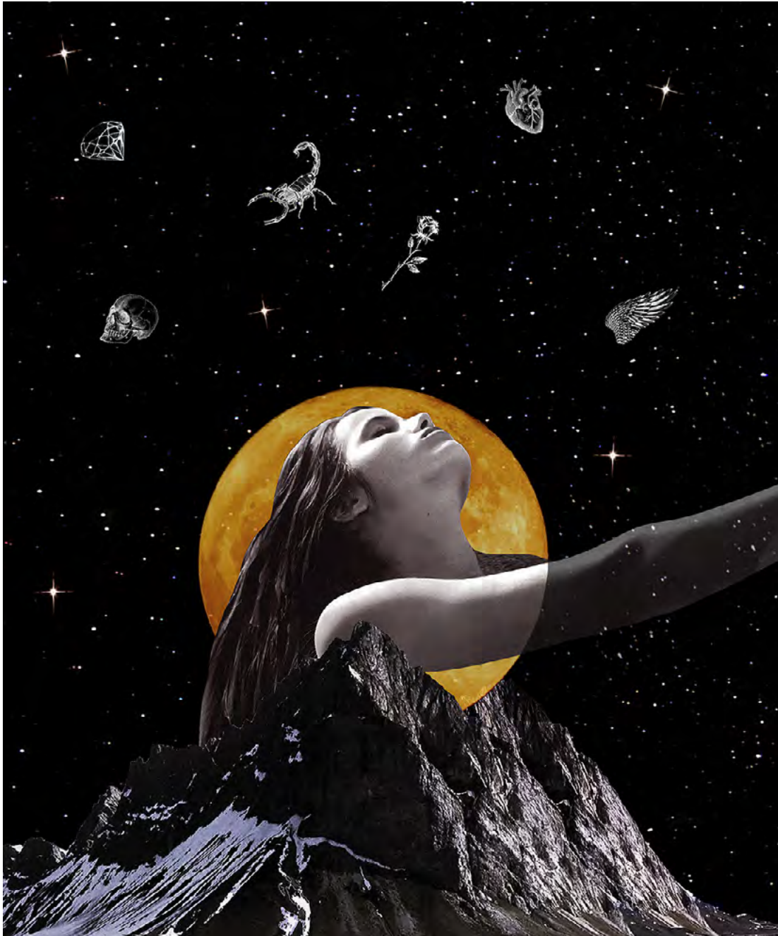
Moon in Scorpio By Rachel Derum Paper collage framed 51 x 41 cm $480 SOLD