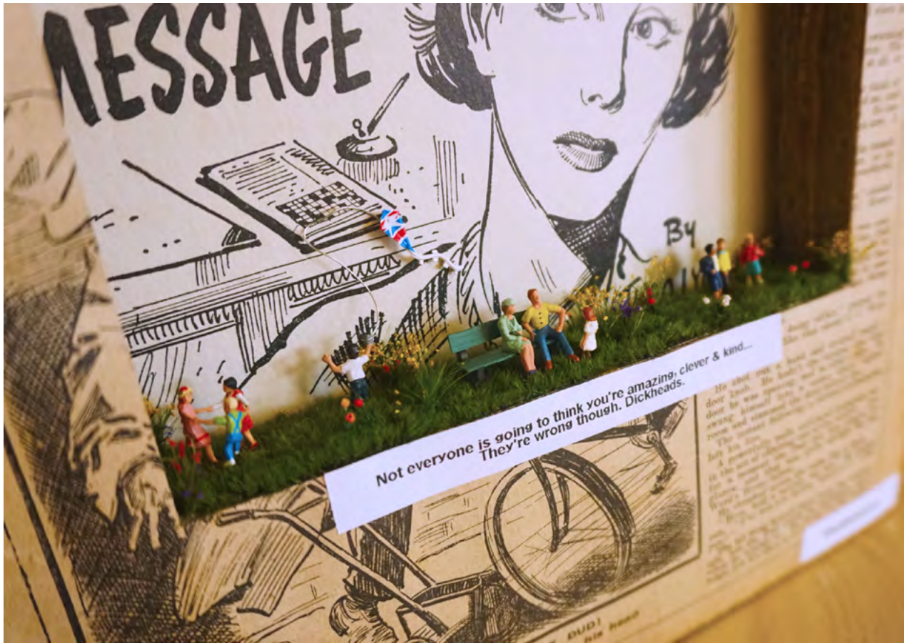
Penelope gets the Message (DETAIL)