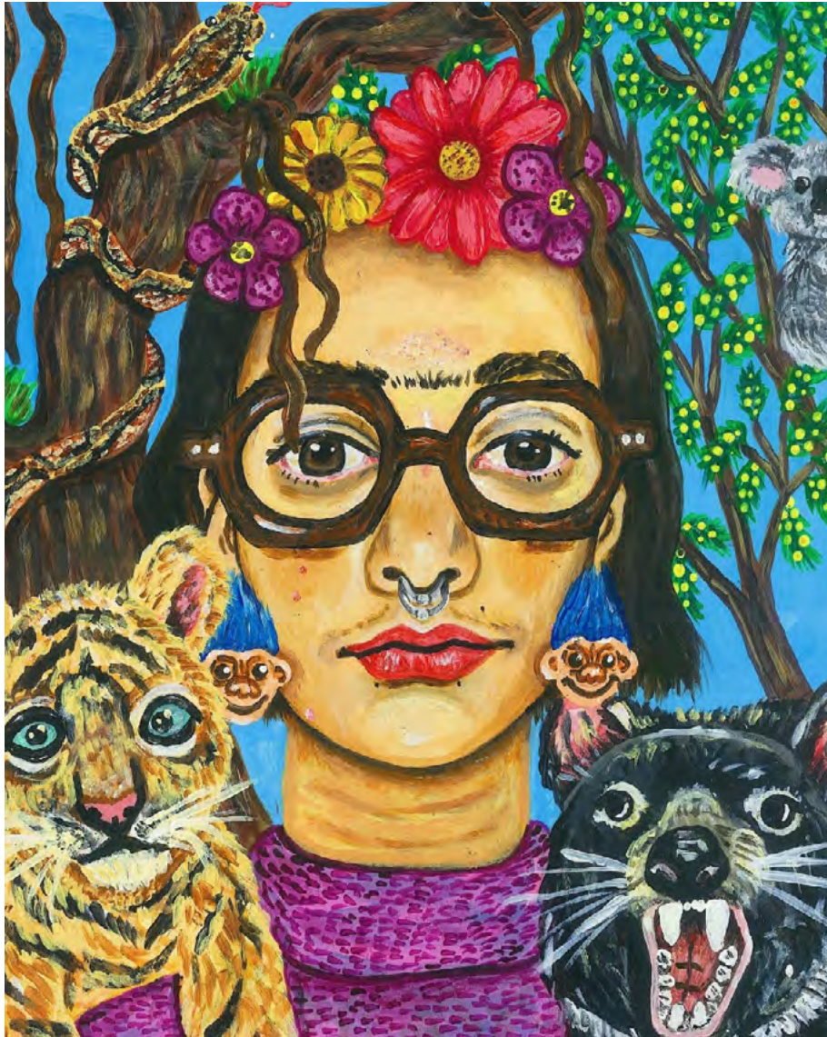
Not Frida By Shan Primrose Acrylic on paper framed 20x25cm $400

10% of sales proceeds donated to Healing Foundation