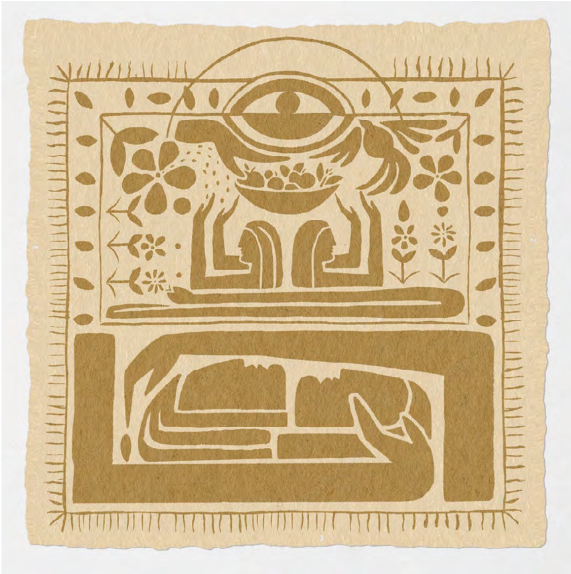
Of the Earth By Natalie Bessell Acrylic and gouache on handmade cotton paper 53.5cm x 57cm $480

10% of sales proceeds donated to Healing Foundation