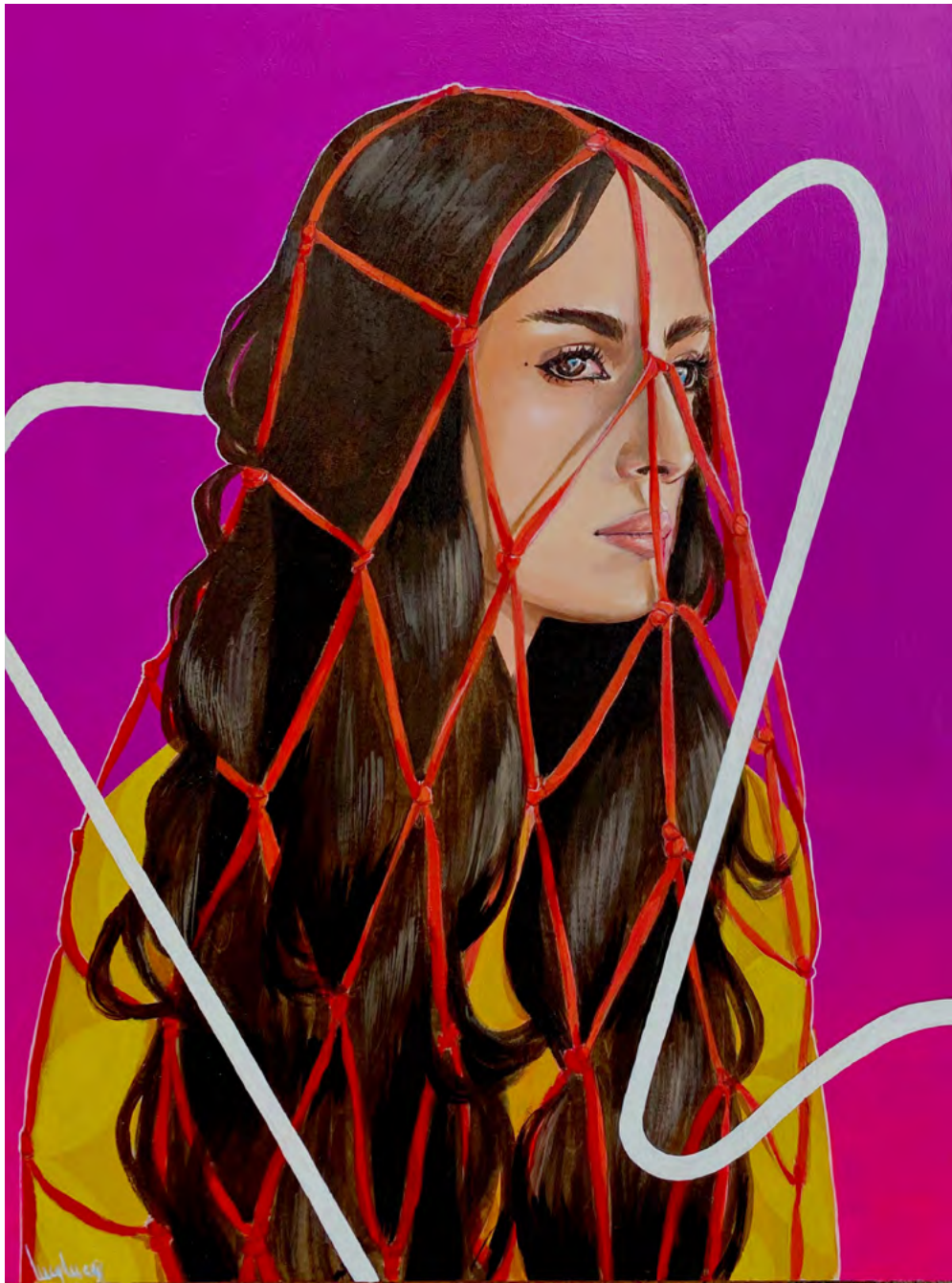
Interlacing By Lucy Lucy Acrylic on timber panel 41cm x31cm $1000