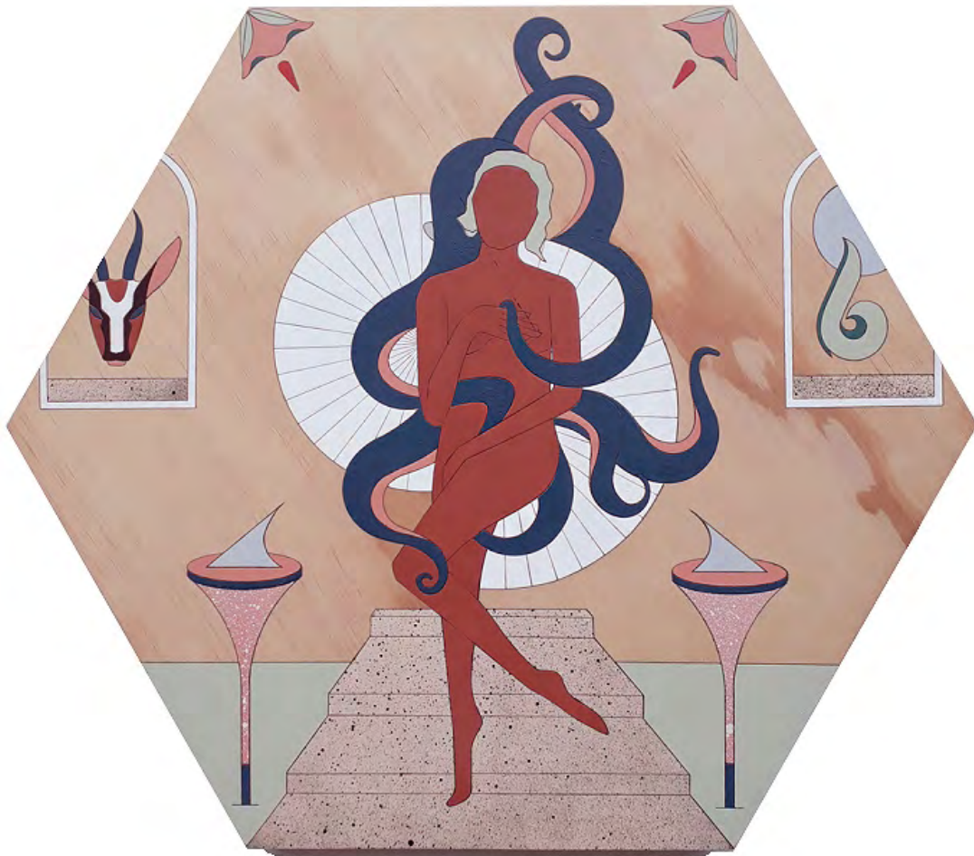
Rebirth By Peatree Acrylic and pencil on timber 35 x 30cm $400