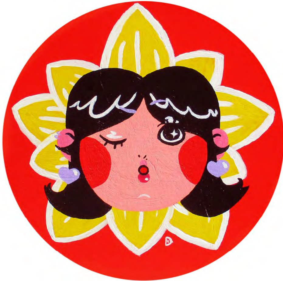
Lucky Lil' Lady By Cindy Nguyen Acrylic and Gouache on timber panel 20cm x 20cm $120 SOLD