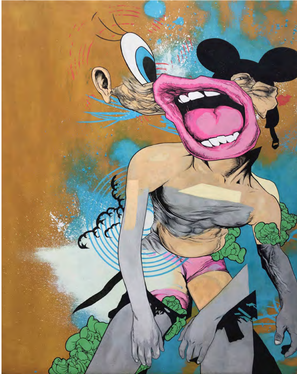
It's a problem By Brendan Rowe Pen and posca on board 40x50cm $370 SOLD