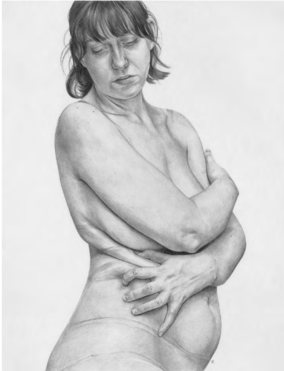
Renaissance Beauty By Rebecca Pidgeon Graphite framed 36x 46cm $750