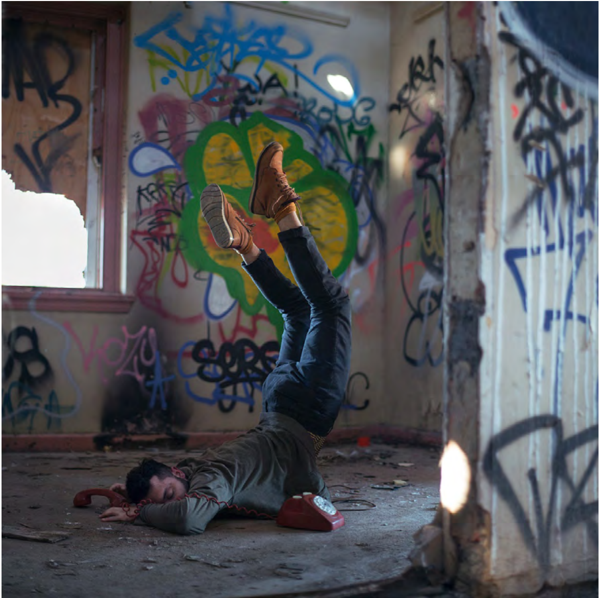
The Weight of your Silence By Ayman Kaake Pigment ink on cotton rag (1 of edition of 5) 61x61cm $720 framed ($520 unframed)

10% of sales proceeds donated to Healing Foundation