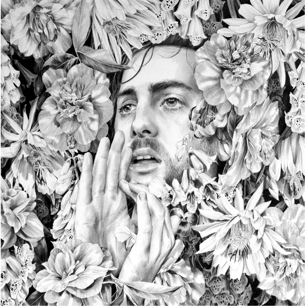
Last Echo By Ryan Pola Graphite framed 58x58cm $850 SOLD