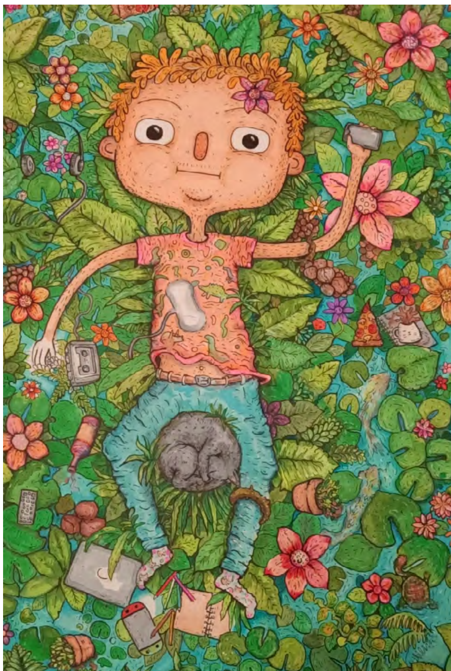
Restless By Zac Grenfell Ink, gouache, pencil on paper framed 32.5 x 45cm $340