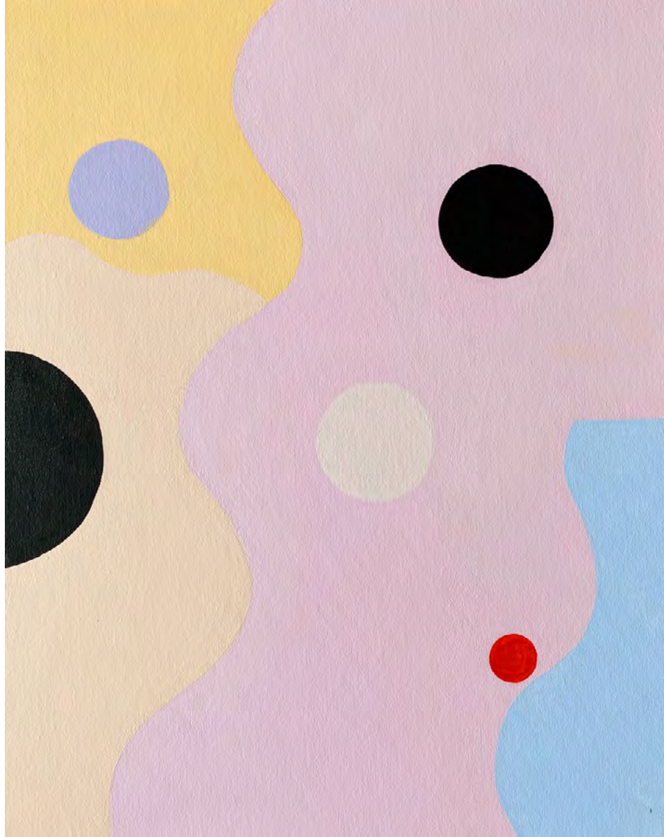
Colour My World By Sara Deane Acrylic 16 x 20 inch $400