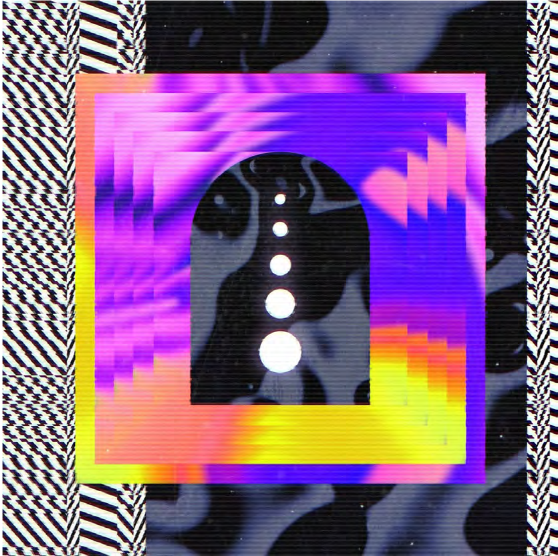
The Space Inbetween By Deandra Rose Creative coding and digital mixed media framed 41 x 41 cm $180 SOLD