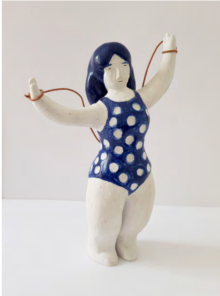
Imperfect By Hellotomato Stoneware Clay & Leather Rope 10 x 14 x 5cm $80 SOLD