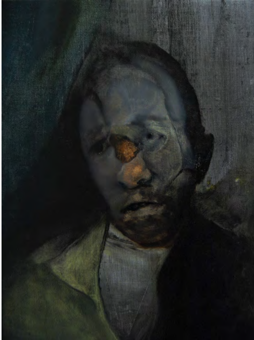
Self By Mitchell Asquith Oil on Linen framed 23cm x 30cm $520 SOLD