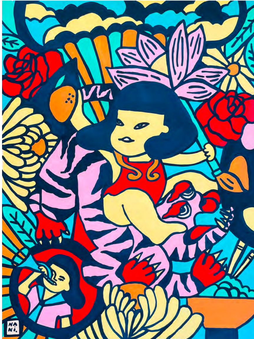
Fresh off the Tiger By Nani Puspasari Gouache on art paper framed 40 x 50 cm $360 SOLD