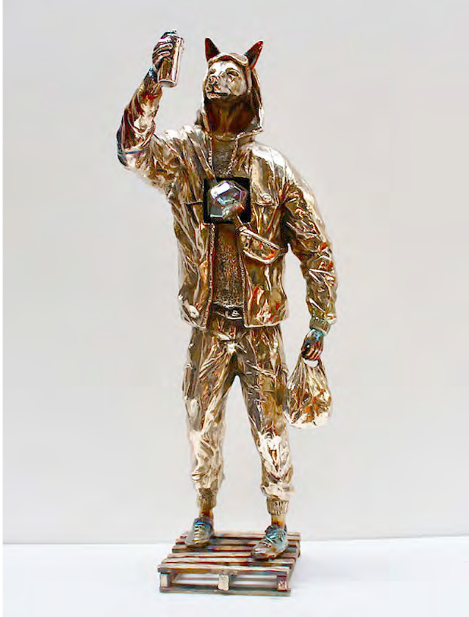
The Messenger By Cezary Stulgis Polished bronze (limited edition) 50cm x 22cm x 24cm $6000