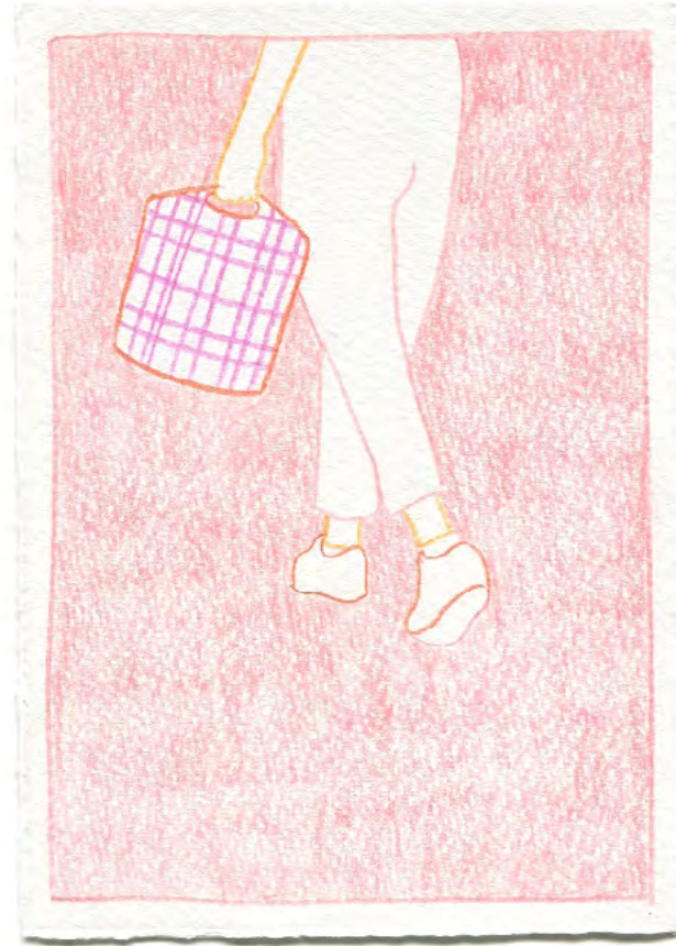
Walking through all seasons no.2 By Alexis Winter Coloured pencil on archival paper framed 23.5 x 28.5 cm $165

10% of sales proceeds donated to Healing Foundation