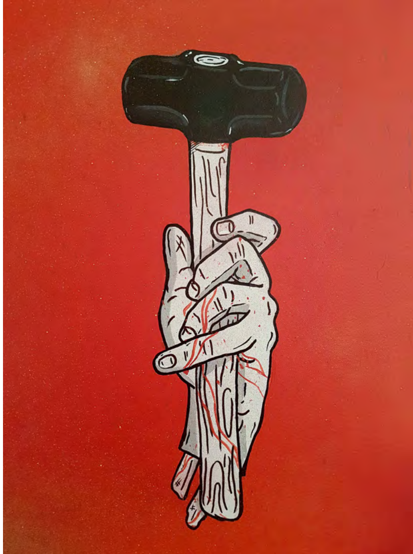
Hang Me by My Bootstraps By FlagBurner Acrylic paint/spray paint/paint marker on Canvas 45 x 60 cm $350

10% of sales proceeds donated to Healing Foundation