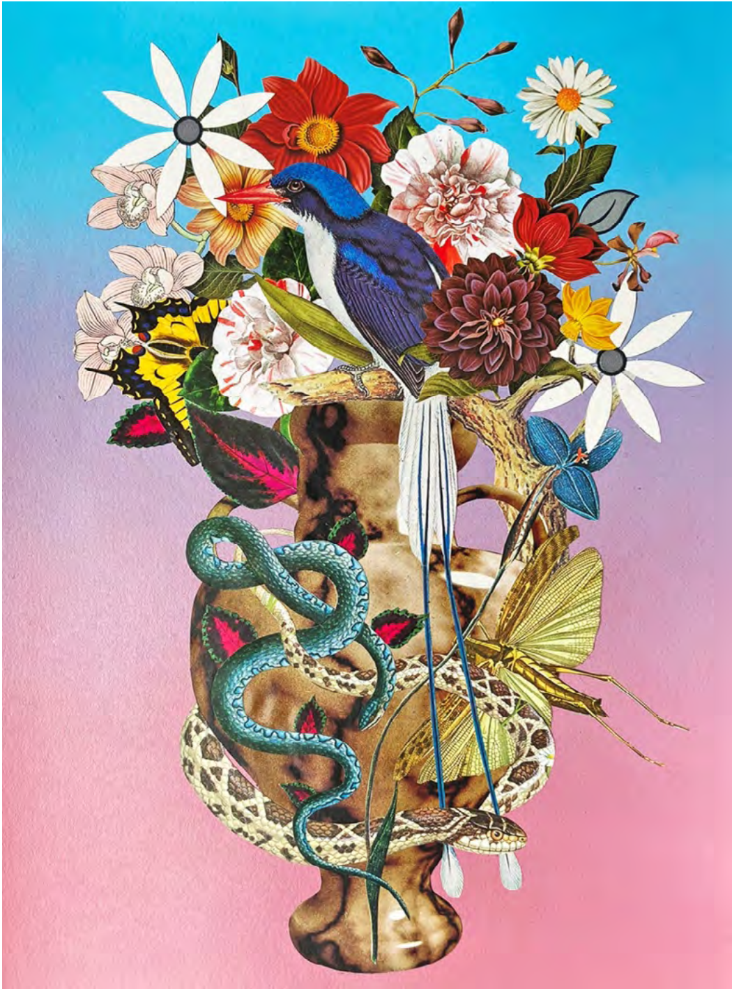
Self By Rachael Edwards Paper collage and aerosol framed 51 x 39cm $550