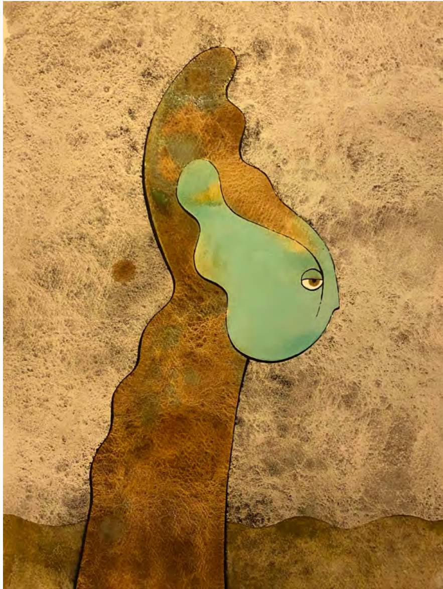
Minerals By Aaron Condon Ink, copper oxide, iron oxide and various found natural pigments framed 60 x 40cm $360