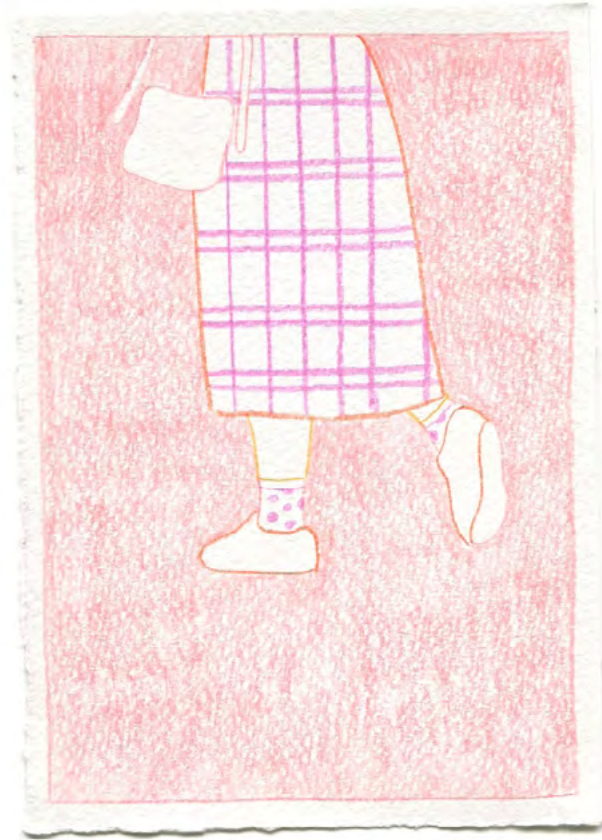
Walking through all seasons no.1 By Alexis Winter Coloured pencil on archival paper framed 23.5 x 28.5 cm $165

10% of sales proceeds donated to Healing Foundation