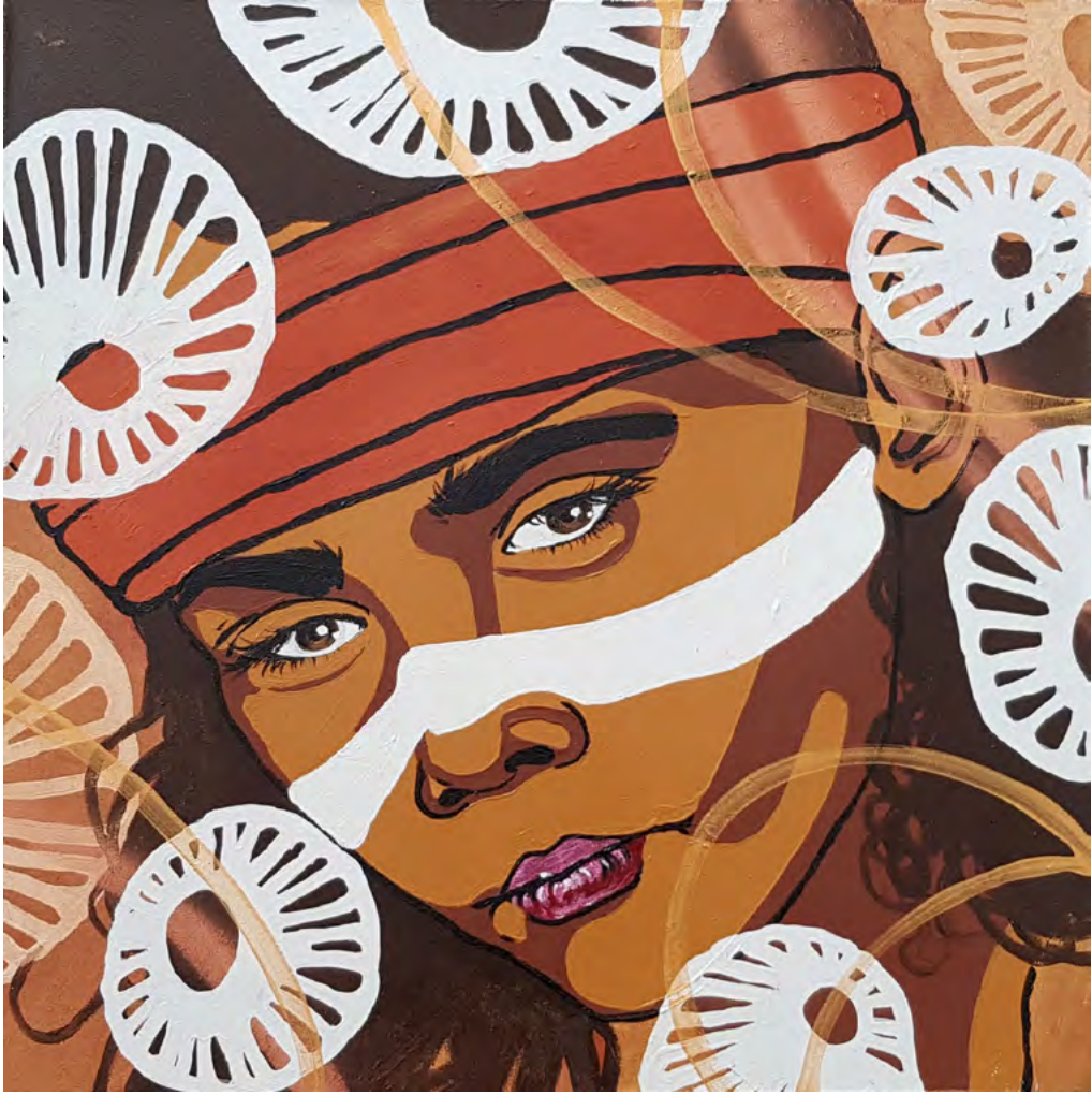
Don't give me that look By Amanda Wright Acrylic, aerosol on canvas 50.5 x 50.5 cm $300

10% of sales proceeds donated to Healing Foundation