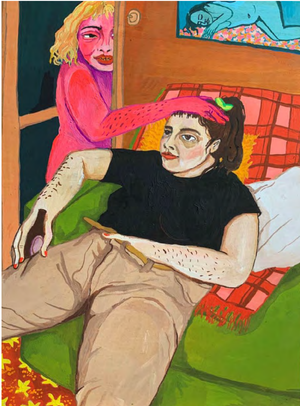
I'm Your Boogeyman By Ruby Knight Gouache on board 23 x 30cm $290 SOLD