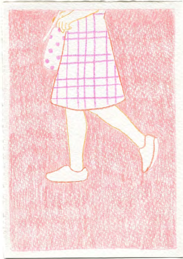
Walking through all seasons no.3 By Alexis Winter Coloured pencil on archival paper framed 23.5 x 28.5 cm $165

10% of sales proceeds donated to Healing Foundation