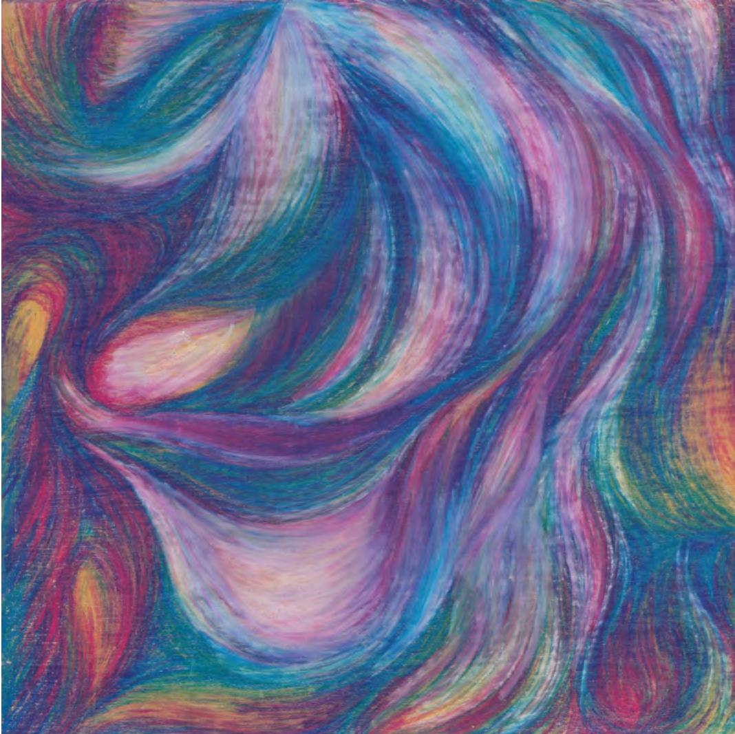
They don't even think we exist By Erin Michelle Prismacolor pencils on board 20cmX20cm $150 SOLD

10% of sales proceeds donated to Healing Foundation