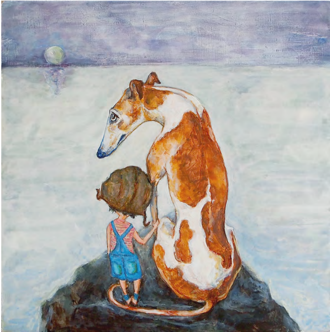
Kiddy No2 - Love is in the sweet air By Ying Huang Gouache on wood in ornate frame 21x21cm $350