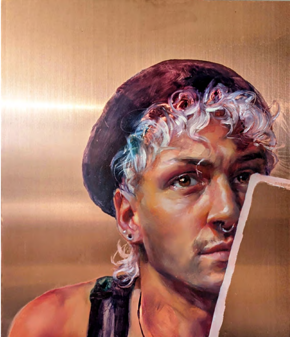
Self Exchange featuring Kyle KM By Liz Gridley Oil on copper composite panel framed 25 x 33cm $550 SOLD

10% of sales proceeds donated to Healing Foundation