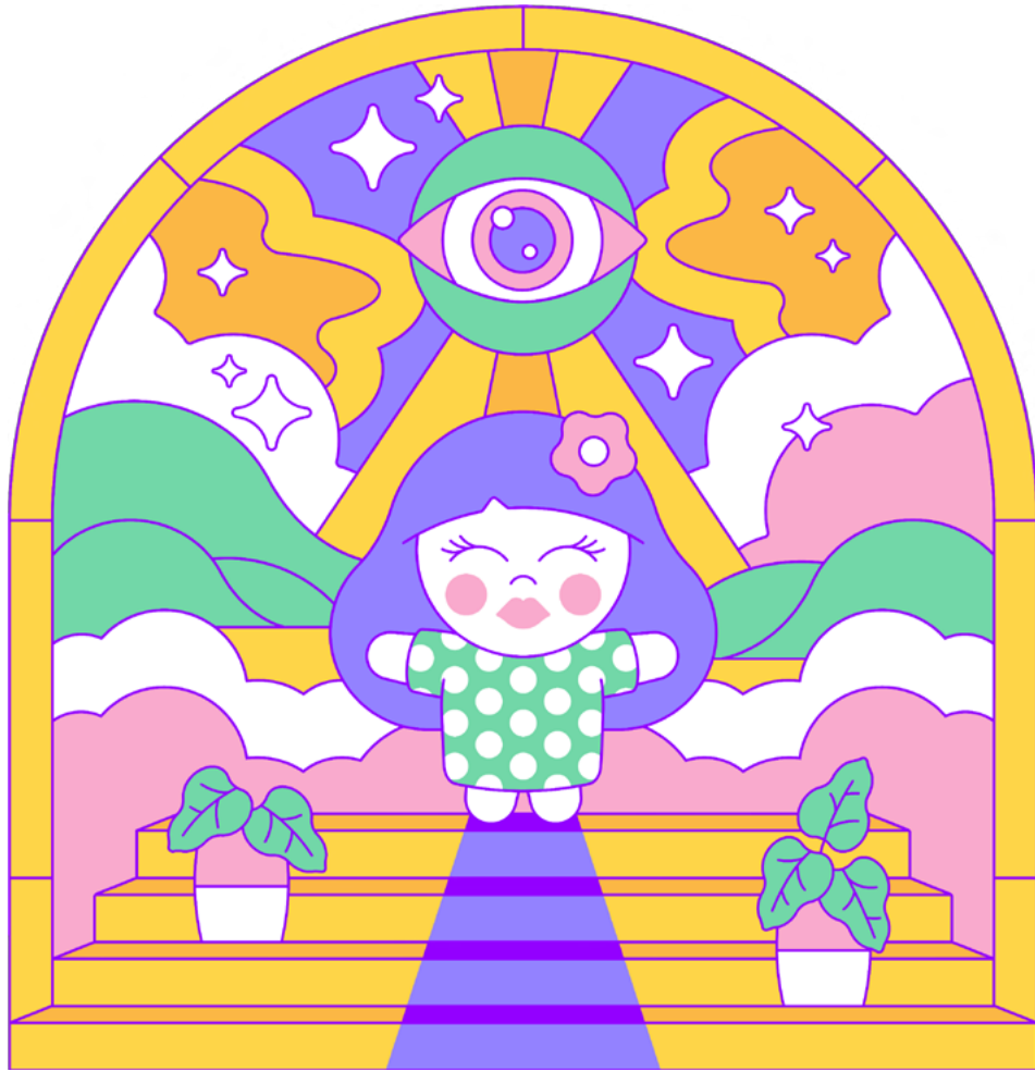
Earth Angel By Chris Costa Two layered digital print on wood 42cm x 42cm $550