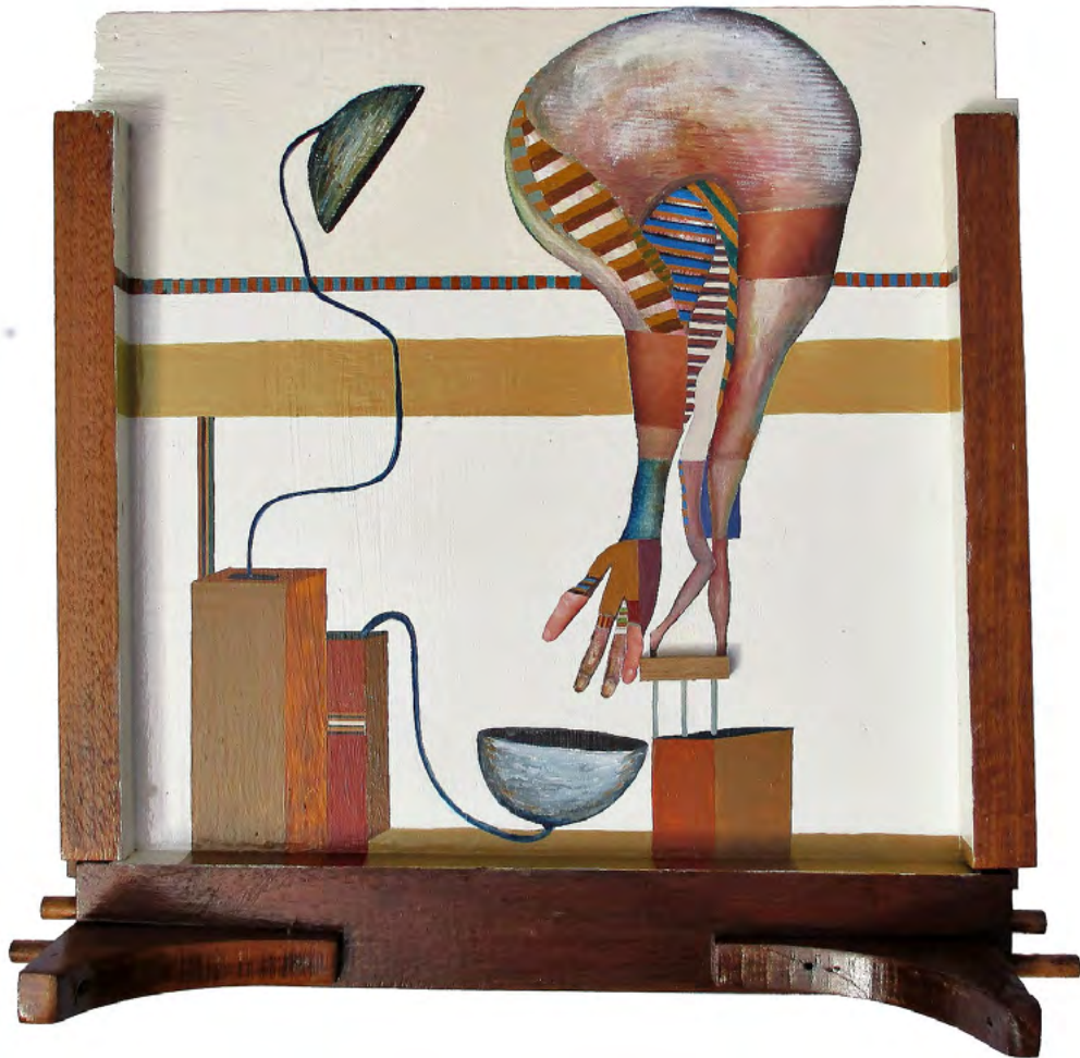
If You Go All The Way In You Won't Be Able To Get Back Out By Tania Matilda Oil on wood 44 x 41 cm $500

10% of sales proceeds donated to Healing Foundation